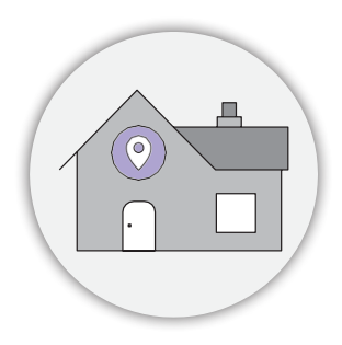
If someone in your household has COVID-19 and you may have been exposed, you should stay in your home until the quarantine period ends.

We must continue to practice the safety measures that help prevent the spread of COVID-19. The best place to start protecting yourself and your loved ones is right in your own home.