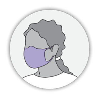
All household members should wear a mask when they are in the same room or space as one another and if they leave home.