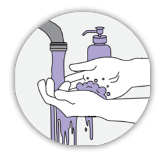
Wash your hands often with soap and water, or use hand sanitizer.